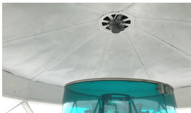
Ceiling of the repainted lantern room, painted by 2Penn Painting and Roofing in August 2020

Consider volunteering any special talents, landscaping, carpentry, electrician or by joining the Board. If you appreciate the Light, or use it to find your way back from sea or across Joppa Flats, we invite you to help. Feel free to call. We'd enjoy talking with you.