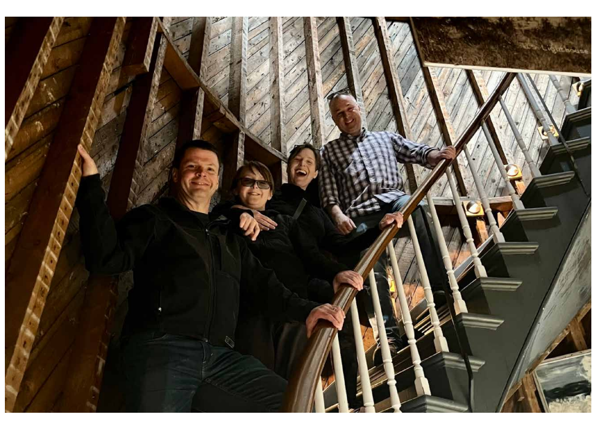
Pictured: Visitors from Minnesota Tour the Light